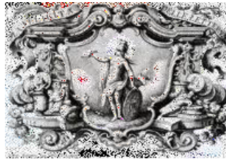
Società Italiana di Studi sul XVIII secolo